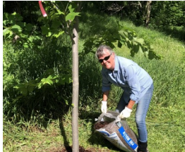
BRNA Spruce Up

June 16 (Tue) 10-Noon "Spruce Up" at Boyne River Nature Area and rain garden. Bring garden tools to mulch memorial trees, pull weeds, weed whip and plant flowers to prepare for summer visitors. Followed by a light lunch. Located in the Boyne City Business Park off M-75 S.