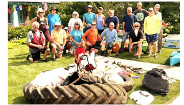
Successful River Sweepers

Sept 2 (Wed) Annual Membership meeting, Veterans Park Pavilion, Boyne City