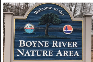
Welcome to the BRNA!

Please join us! Bring gloves and garden tools. With a dozen volunteers, we anticipate a one or two-hour project. Thank you.