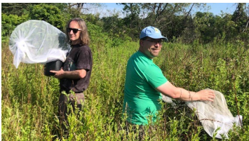
2021 Beetle Release