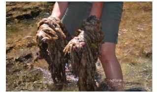
“Rock snot” will spread