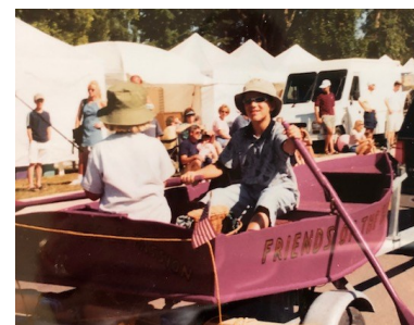
Seen in many July 4 parades

Our mascot, unfortunately, is past its prime. Should you have a small, wooden boat to donate, please call any board member.