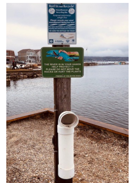
Fish line container