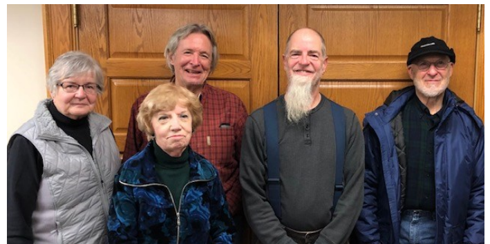
2022 Board of Directors Officers