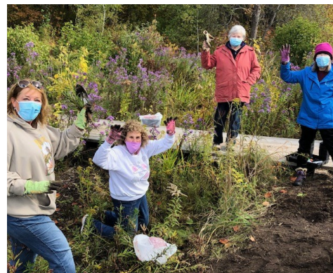
Rain Garden Planting 2020

Details shared later via email, boyneriver.org and Facebook/Boyne River