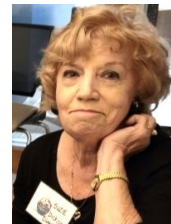
Board Member Emeritus