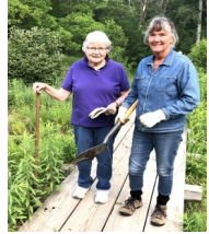
BRNA Spruce Up

purple loosestrife has since spread to wild areas and degraded habitat for native plants and animals. We partner with Tip of the Mitt Watershed Council to purchase then distribute the beetles.