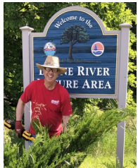
BRNA Spruce Up

June 17 (Tue) "Spruce Up" at Boyne River Nature Area and rain garden.